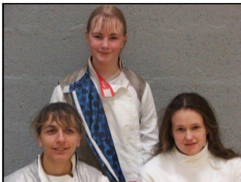
GWENT 'B' Women's Team