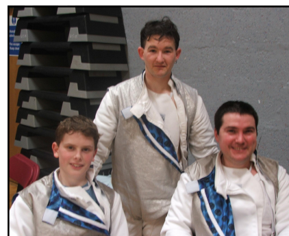
GWENT 'C' Men's Team