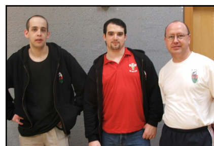
GWENT 'D' Men's Team