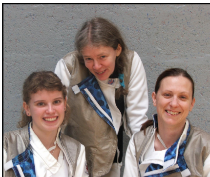
GWENT 'A' Women's Team

In the men's competition, in addition to Gwent A finishing second, the B team were sixth, the C team seventh and the D team tenth, while in the women's competition, supporting the second-placed A team, the B team finished fourth.