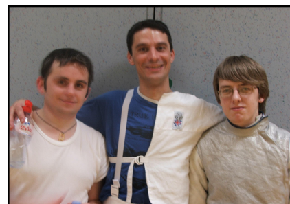
GWENT 'B' Men's Team