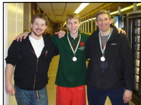
GWENT 'A' Men's Team